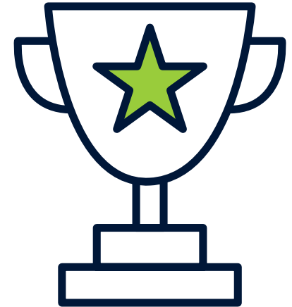
ISG Star of Excellence